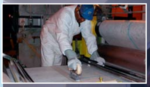
G-476 textile splicing